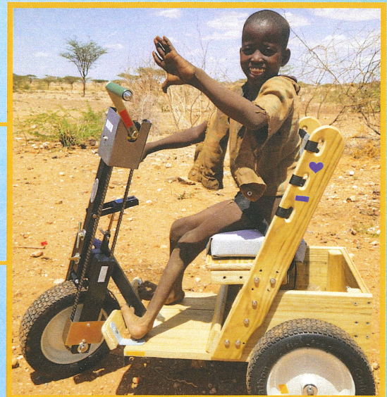
10 year old Boya had contracted Polio.